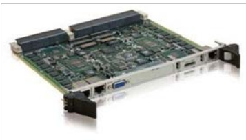
Figure 4.23. A VME64x chassis with its backplane and a VPX 6U board