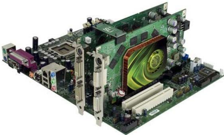
Figure 4.19. The SLI by Nvidia